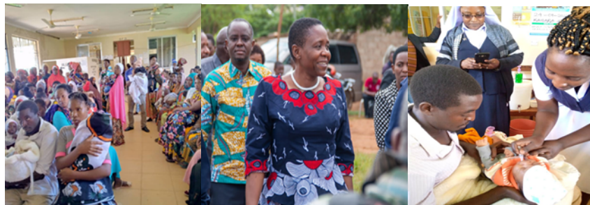
Photos: African Vaccination Week celebrations in different regions of Tanzania.

Using the theme “vaccines bring us closer,” African Immunization Week 2021 urged greater engagement around immunization to promote the importance of vaccination in bringing people together, and its role in improving the health and wellbeing of everyone, everywhere, throughout life. African Vaccination Week was celebrated across Tanzania with a national commemoration in Morogoro region. The Minister of Health used this opportunity to advocate for community uptake of all vaccines, particularly the HPV vaccine.